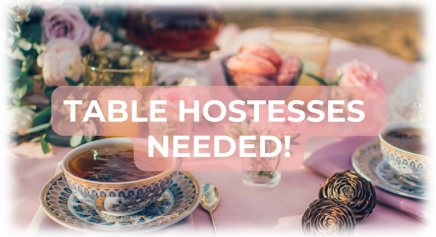
TABLE HOSTESSES NEEDED!